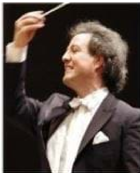
Manfred Honeck